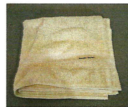
Made in USA