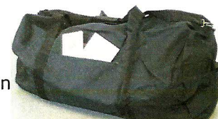
Made in China