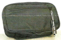
Made in China