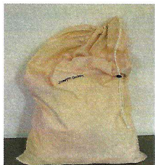
Made in USA

Item # BL01 - $19.00 (24"x36") Colors may vary.